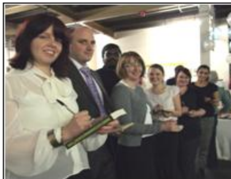
The team from Barclays, who lent a hand with just about everything on Ladies Night

A HUGE thank you to all our corporate sponsors who've helped us in so many ways over the last 12 months! We can't mention them all, but special thanks to Northwards Housing, Arcus, the Bank of NY Mellon, Icon, the Co-op, John Lewis, Watson Moore, Guinness Northern Counties, Sainsburys, Creative Lynx and Quayside Bakery. A special thank you goes to Barclays, whose brilliant team of staff volunteers helped make our Ladies Night a success, and Black Pepper Catering, who provided food for the event